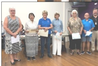
Top photo: Community Grant recipients; Middle: Sponsorship Grant recipients; Bottom: Charity Grant recipients.

In 2009 a Grants Programme was introduced and up to 2023 a Grand Total of $1,530,043 has been distributed by the Kendall Community Op Shop over the past 15 years.